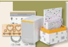
MEMORIES IN THE MAKING PROJECT LIFE BUNDLE OC p. 43 140575 $38.25

Add a little extra pizzazz to your memory keeping with the Memories in the Making Project Life Specialty Card Collection. You can easily earn it for free by purchasing these Project Life products: